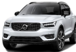
Volvo XC40 (2017)