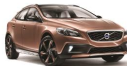
Volvo V40 Cross Country (2012)