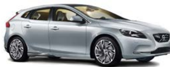
Volvo V40 (2012)