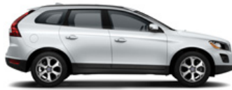
Volvo XC60 (2008)