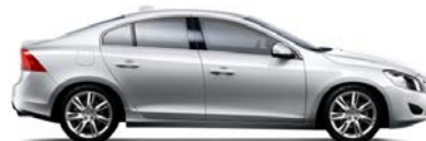
Volvo S60 (2010)