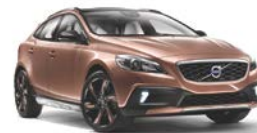
Volvo V40 Cross Country (2012)